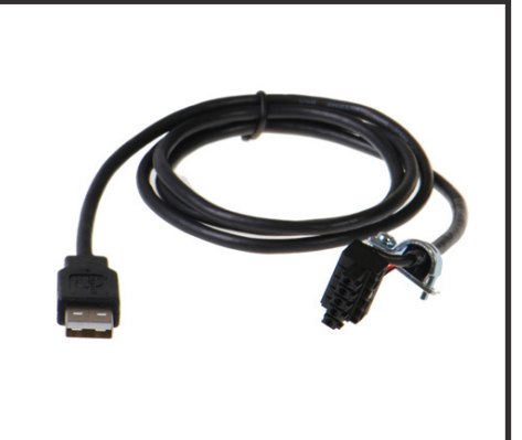
PW-650 Power supply with USB connector and prewired screw terminal block. Suitable for use with 5V USB ports.

PW-600 Power supply with connectors for UK, USA, EU and AUS mains socket. 'Tails' are suitable for connecting to screw terminal blocks.